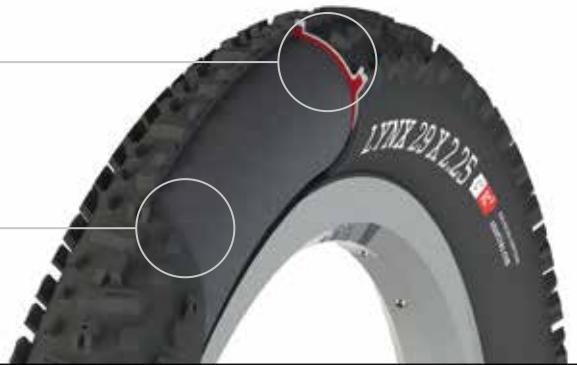
LYNX 29 x 2.25

Cross Country casing for daily use and training with 60TPI.