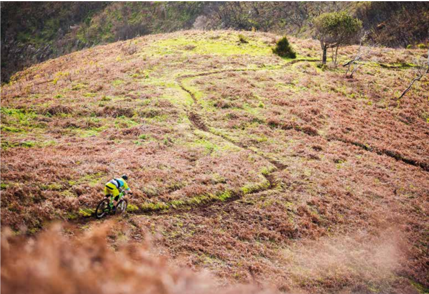
Madeira Island, PRT