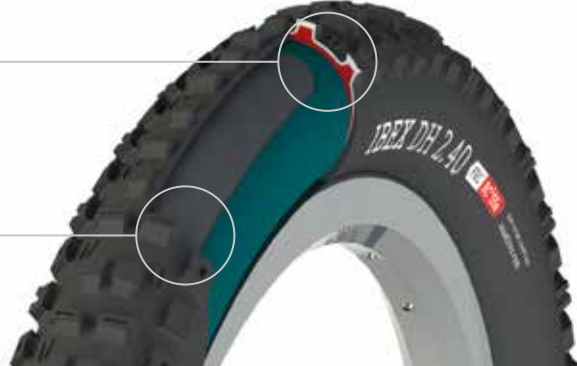
IBEX DH 2.40

Freeride casing for daily use and training with 60TPI.