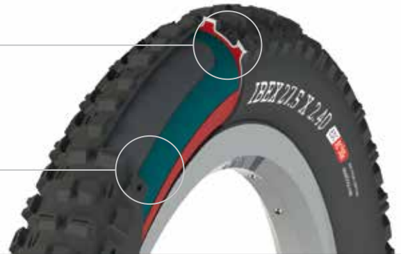
IBEX 27.5 x 2.40

Enduro Casing with 60TPI and light weight butyl inlays providing very high puncture protection. Tubeless Ready TLR.