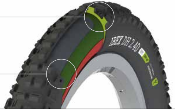
IBEX DH 2.40

Dual ply casing with butyl inlay and additional 40x40TPI bead to bead construction.